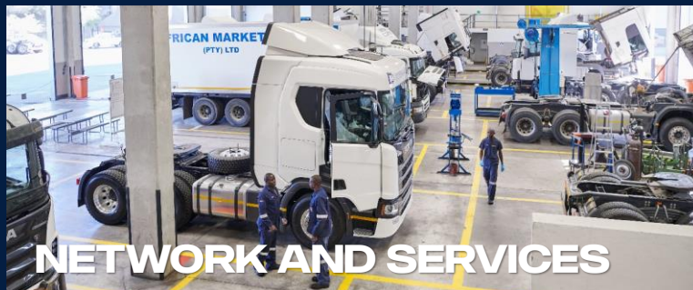
NETWORK AND SERVICES